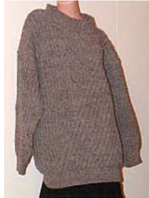
Our own design with funnel neck and diagonal ridges.