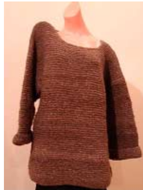
Fly fishermen love our lammies