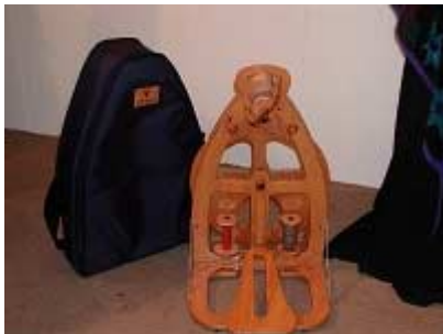
Ashford's Joy. It folds up and fits into a bag to make it very portable.