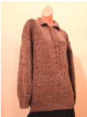
Polo jumper with cables. All garments are hand-knitted and most are made from handspun yarn.