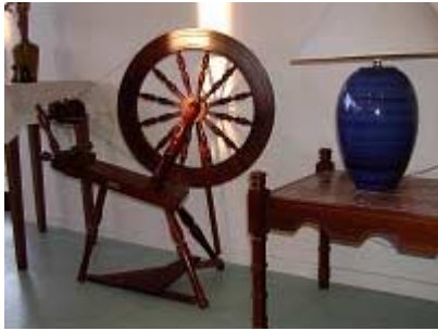
The Ashford Elizabeth wheel

Hallblacks stock spinning accessories, most of which are Ashford products. Our prices are those recommended by Ashfords and are the same as the factory would charge retail customers. We do, on occasions, offer specials.