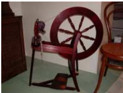
The Ashford Traditional wheel