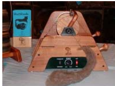
The Ashford electronic wheel, a must for busy spinners. Halves the spinning time for me. We also offer second-hand wheels and drum-carders for sale when available.