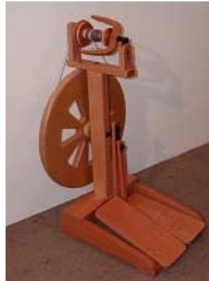
Ashford's Kiwi wheel. This is real value for money.