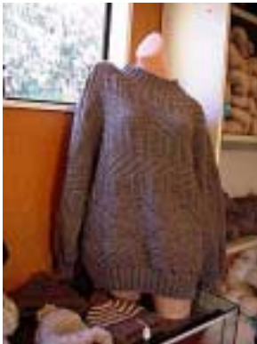
Different patterns in horizontal layers.