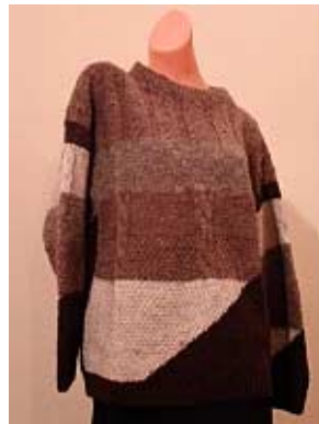
Multi-coloured garments show off the range of natural colours now available. Visitors often express disbelief at the variety of colours. Many then want to see the sheep which produce such surprising shades.