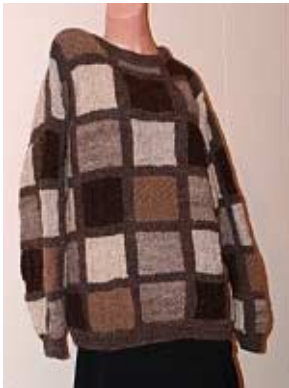
Each square has a different texture

Hallblacks produce knitwear which reflects the skill and diversity of New Zealand knitters. From the very popular 'farm' jerseys to the more intricately fashioned garments, the stock is designed to look good and keep the wearers warm.